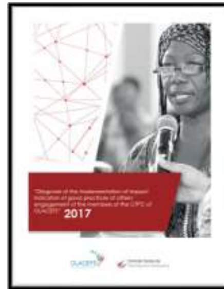
Roles and Responsibilities of SAIS in Social Accountability